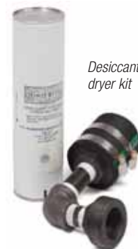
Desiccant dryer kit