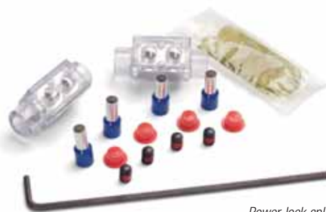
Power-lock splice kit